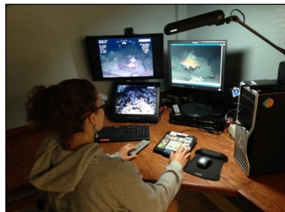
Figure 2. Typical video post-processing station.

After completion of video review for habitat and substrate, all video was processed to estimate finfish and macro-invertebrate distribution, relative abundance, and density. During three separate viewings of the video, finfish and macro-invertebrates were classified to the lowest taxonomic level possible. Observations that could not be classified to species level were identified into a species complex, grouped based on morphology, or recorded as unidentified. During video review, both the HD video and HD still imagery were used to aid in species identifications. Each fish or invertebrate observation was entered into a database along with UTC timecode, taxonomic name/grouping, sex/developmental stage (when applicable), and count. For fish only, size was estimated using the two sets of parallel lasers as a gauge. When applicable, estimates of total length were recorded with each fish observation. All clearly visible finfish were enumerated from the video record.